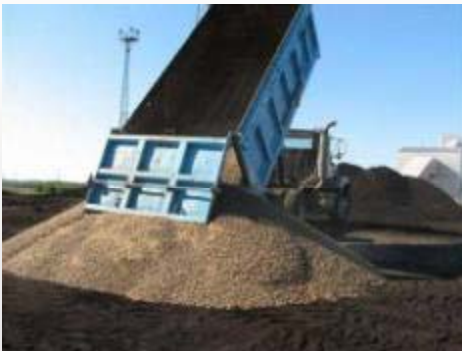
Thunder Bay GS