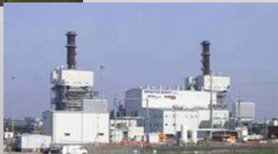
Brighton Beach* 580 MW