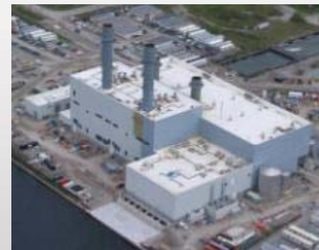
Portlands Energy Centre* 550 MW