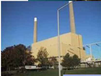
Lennox 2,100 MW