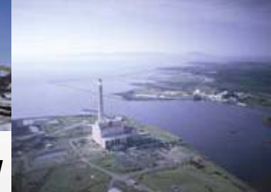
Thunder Bay 306 MW